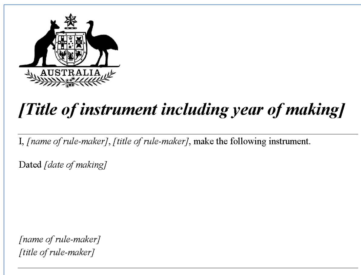
Illustration 3A—generic official branding and making words 7

62 These titles can be verified with the ExCo and Government Division of PM&C.